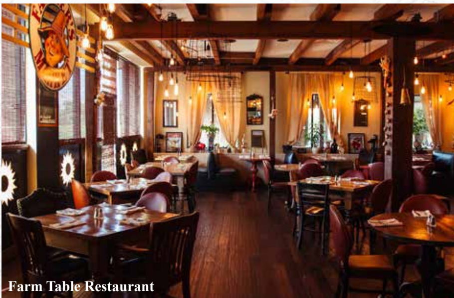
Farm Table Restaurant