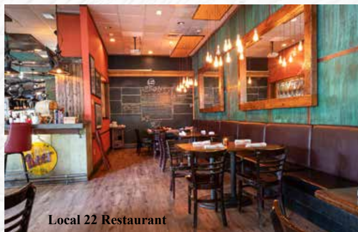
Local 22 Restaurant